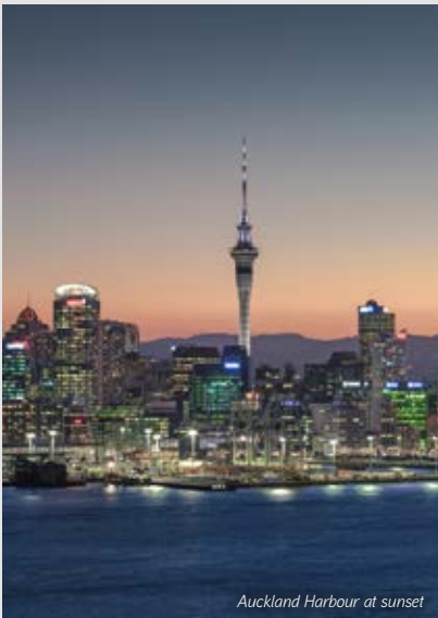
Auckland Harbour at sunset

Gain the industry-specific skills you need to get a great job. Contact our International specialists today.