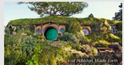
Visit Hobbiton, Middle Earth

New Zealand is a peaceful, safe, multicultural and welcoming country which provides fabulous lifestyle and adventure opportunities everywhere you go. You can enjoy an outdoor lifestyle year-round with a range of attractions to explore while you study in a highly developed English-speaking country.