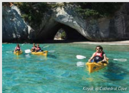
Kayak in Cathedral Cove