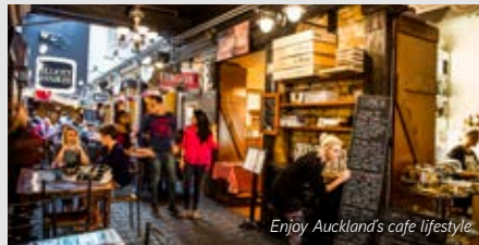
Enjoy Auckland's cafe lifestyle.