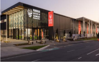
TechPark Campus 58 Manukau Station Road, Manukau, Auckland