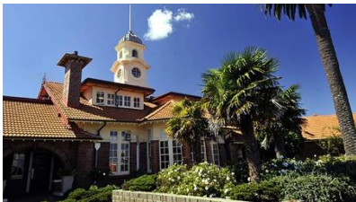
Ōtara Campus 53 Ōtara Road, Ōtara, Auckland