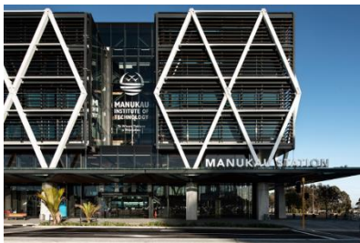
Manukau Campus Corner of Manukau Station Road Davies Avenue, Manukau, Auckland